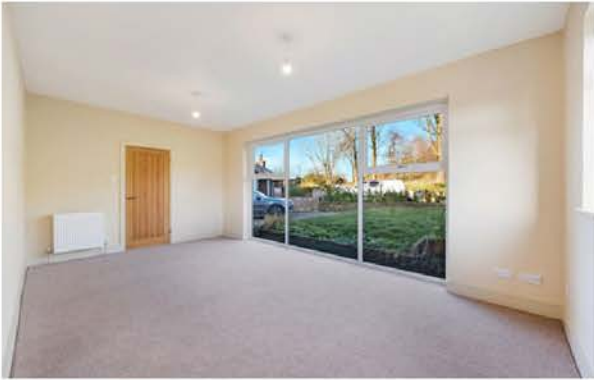
INTERIOR - LOUNGE