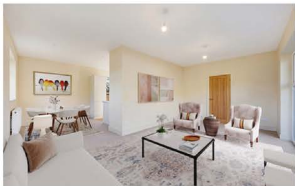
INTERNAL - LIVING ROOM