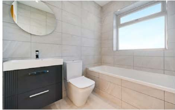
INTERNAL - BATHROOM