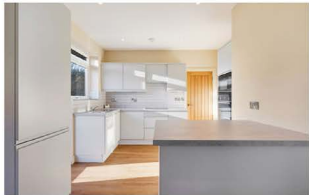
INTERNAL - KITCHEN