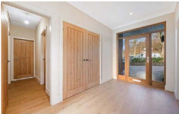
INTERNAL - HALLWAY