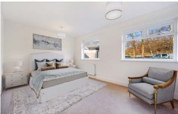
INTERNAL - BEDROOM