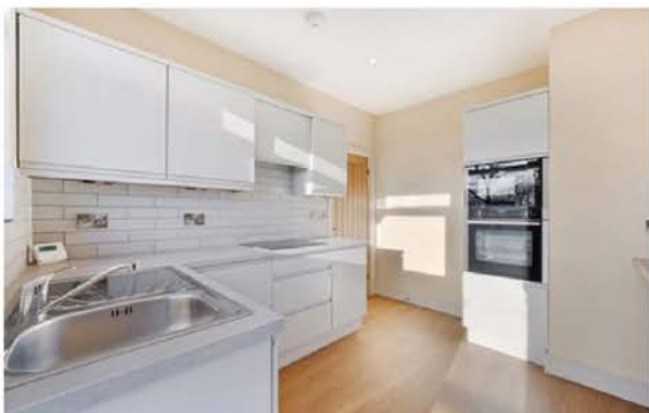
INTERNAL - KITCHEN